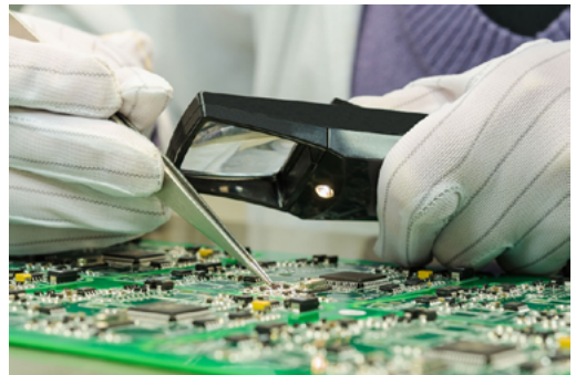
Electronics and systems biology studies identify functions in biological networks.

This program prepares for doctoral studies in France and abroad. It leads to jobs in the public and private sectors (scientists, engineers, lecturers, project managers, journalists).